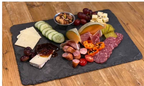
Meat & Cheese Board For Two